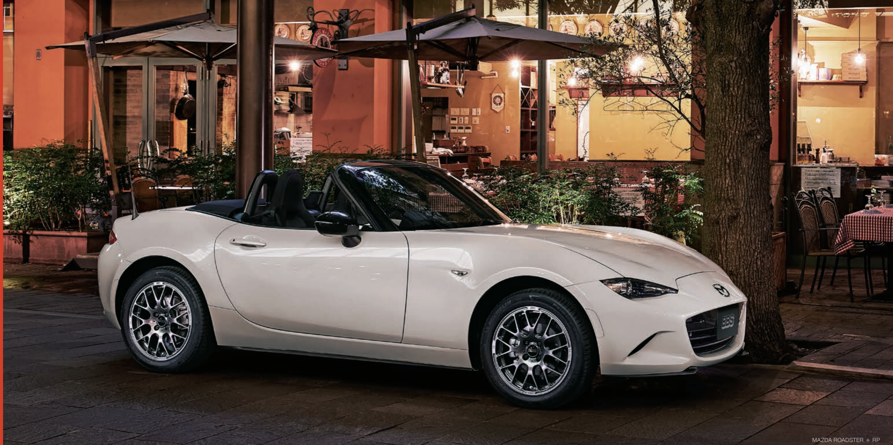
MAZDA ROADSTER + RP