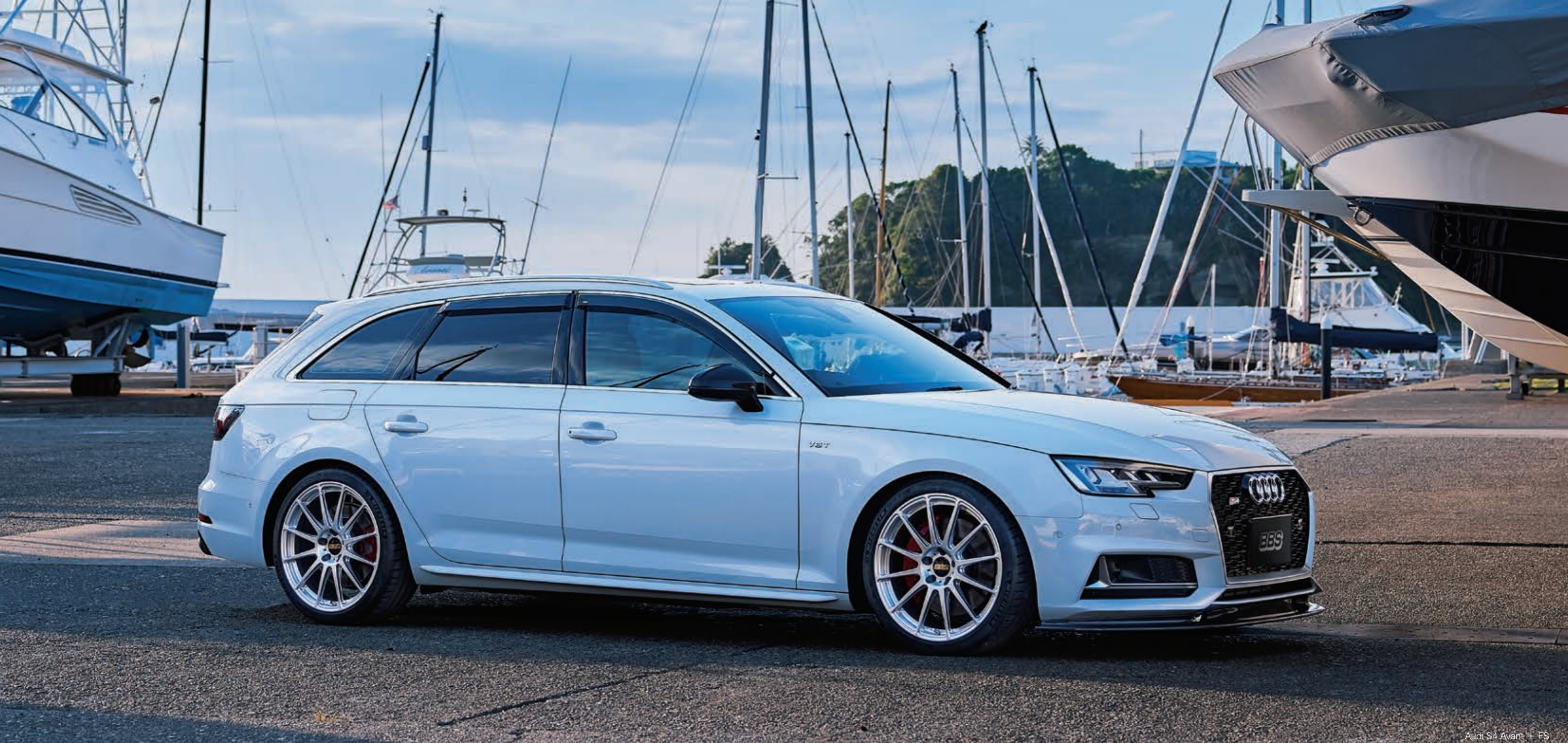
Audi S4 Avant + FS