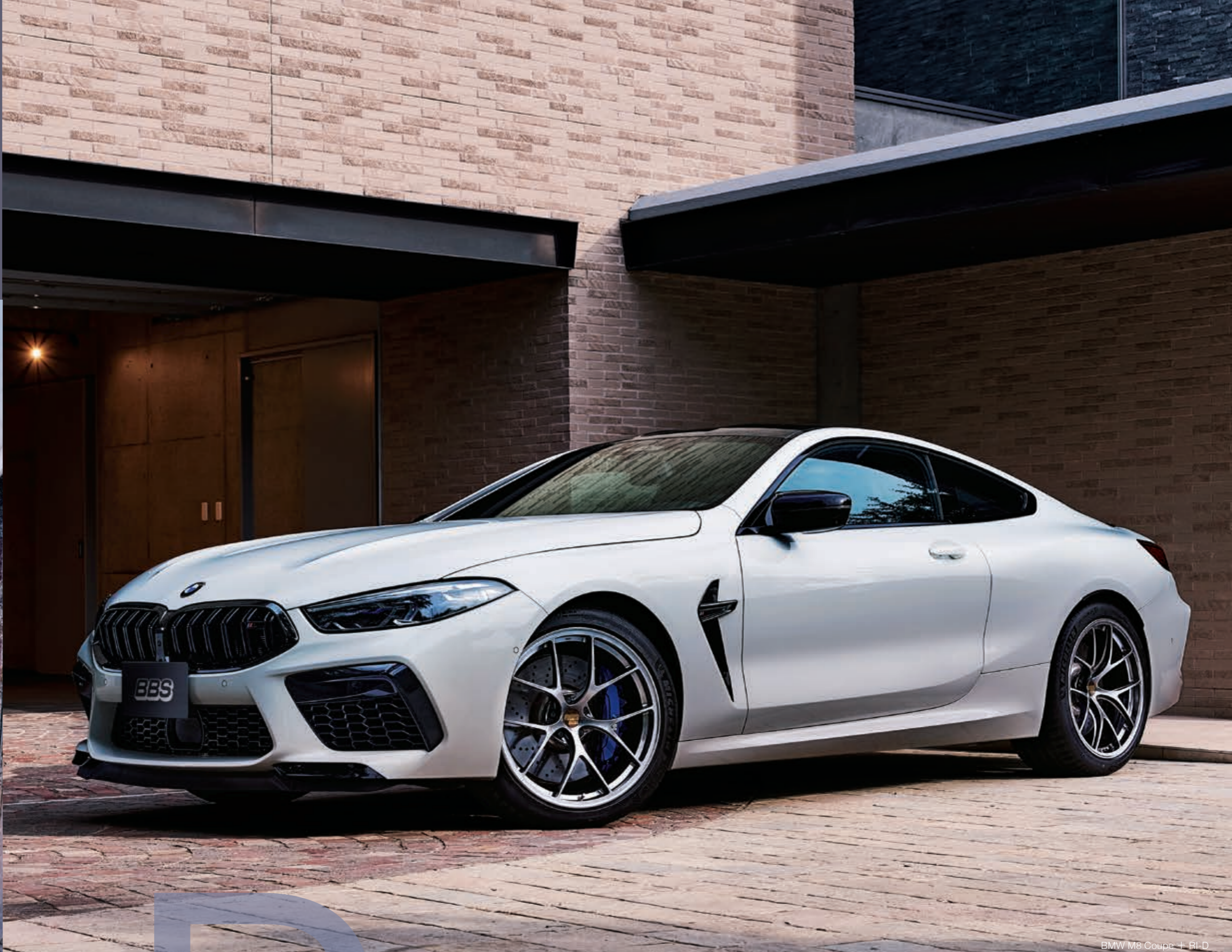
BMW M8 Coupe + R1-D