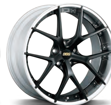
Matte Black disk and Silver Diamond-cut rim (MB-SLD)