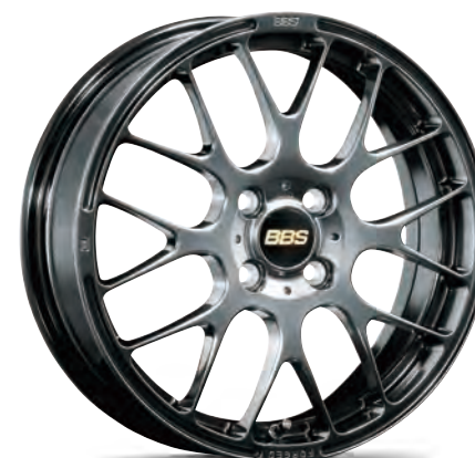
Diamond Black (DB)