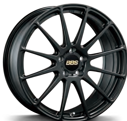
Matte Black (MB)