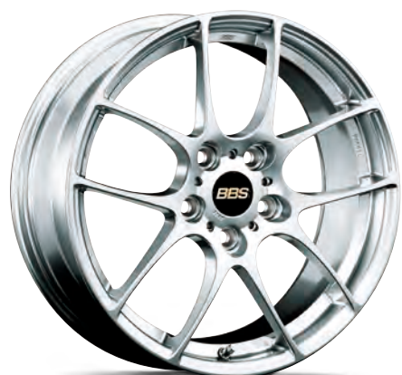
Diamond Silver (DS)