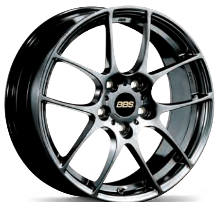
Diamond Black (DB)