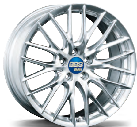
Diamond Silver (DS)