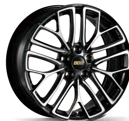
Black Diamond-cut (BKD)