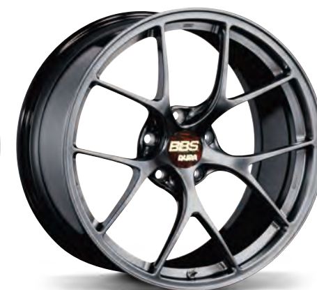
Diamond Black (DB)