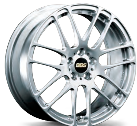
Diamond Silver (DS)