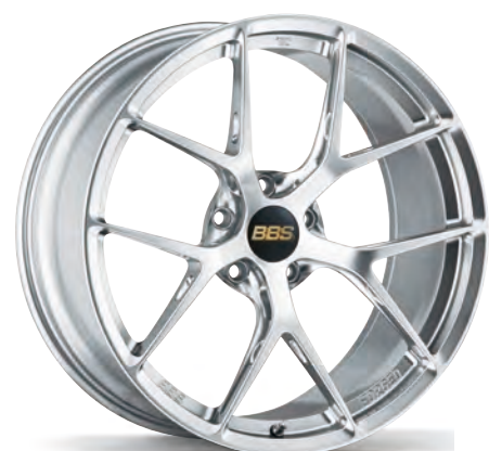
Diamond Silver (DS)