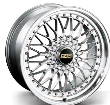
Silver disk and Silver Diamond-cut rim (SL-SLD)