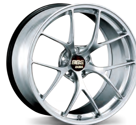
Diamond Silver (DS)