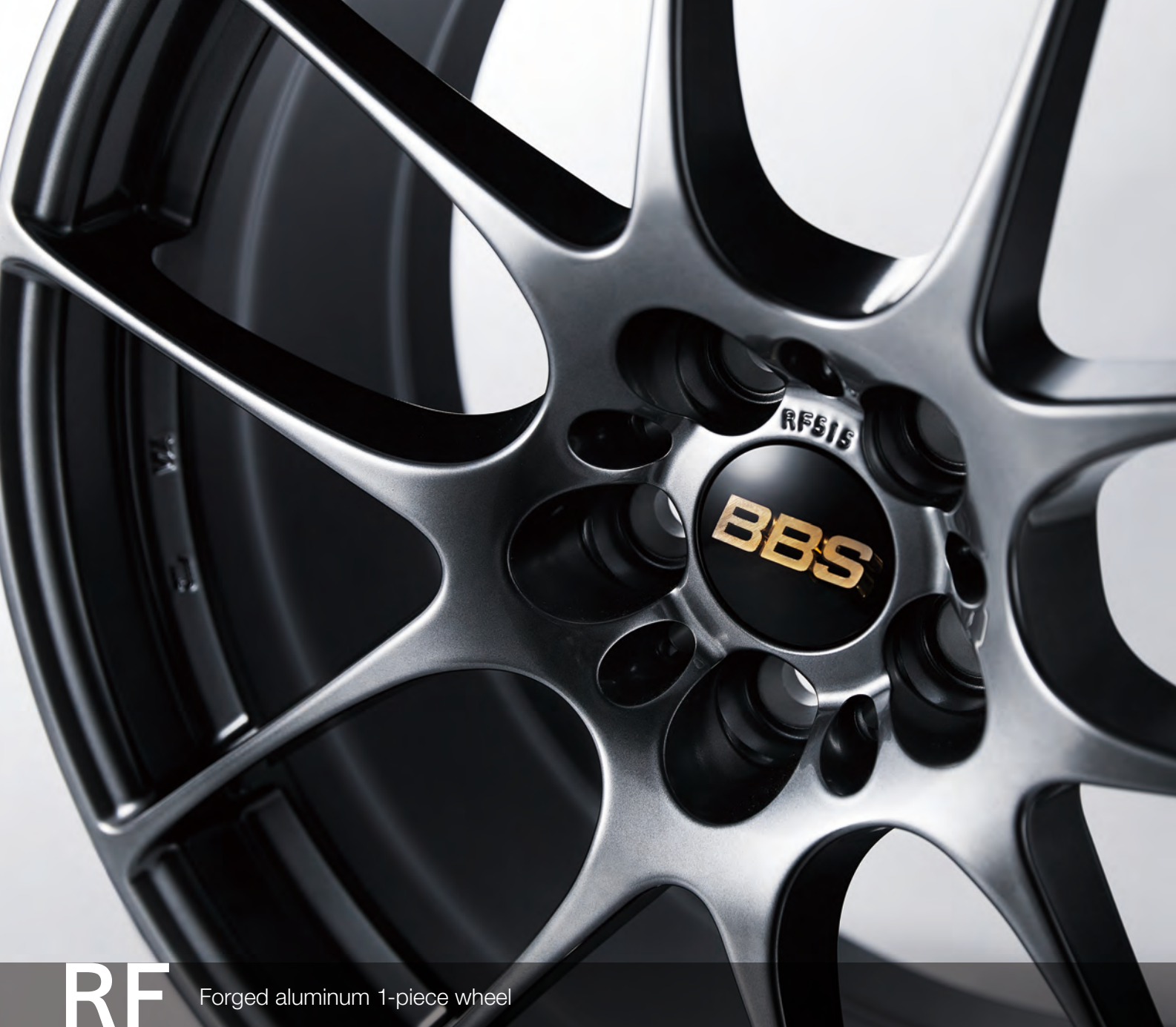
RF Forged aluminum 1-piece wheel

Agile and exhilarating styling—for drivers who appreciate a lightweight wheel. With its 5 slender cross spokes proceeding elegantly from the center, this subtle yet dynamic design gives a truly lightweight visual impression. Born of our pursuit of top performance, this model leverages its ultra-light aluminum 1-piece structure to support nimble off-the-line starts and a sharp, responsive steering feel.