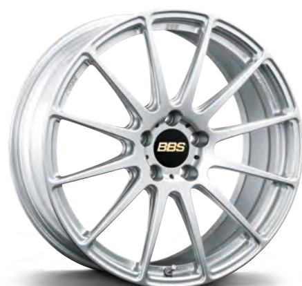
Diamond Silver (DS)