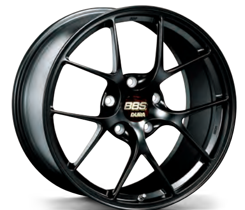
Matte Black (MB)