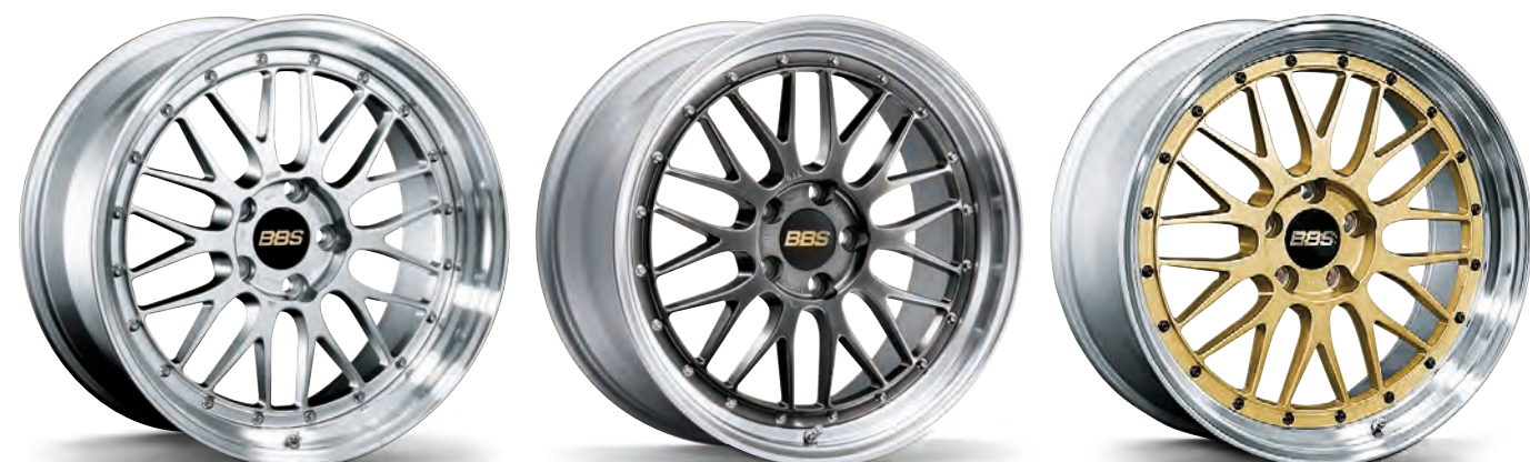
Diamond Silver disk and Silver Diamond-cut rim (DS-SLD)

17 18 19 20 21 inch PRODUCT LINEUP ► page 26