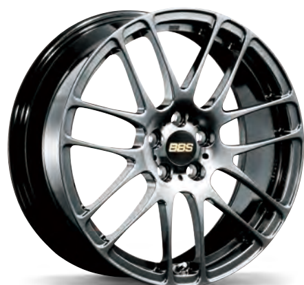
Diamond Black (DB)