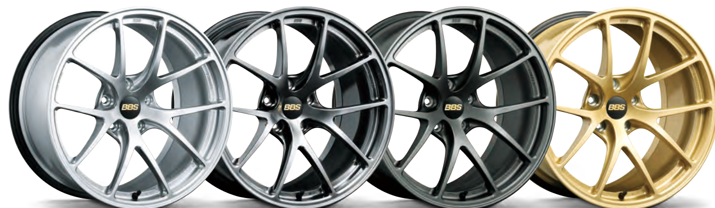
Diamond Silver (DS)