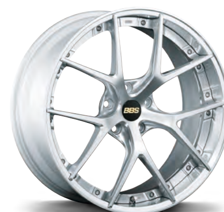
Diamond Silver disk and Silver Diamond-cut rim (DS-SLD)