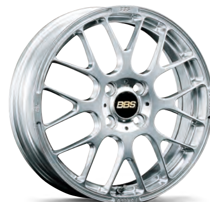
Diamond Silver (DS)