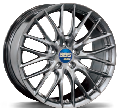
Diamond Black (DB)