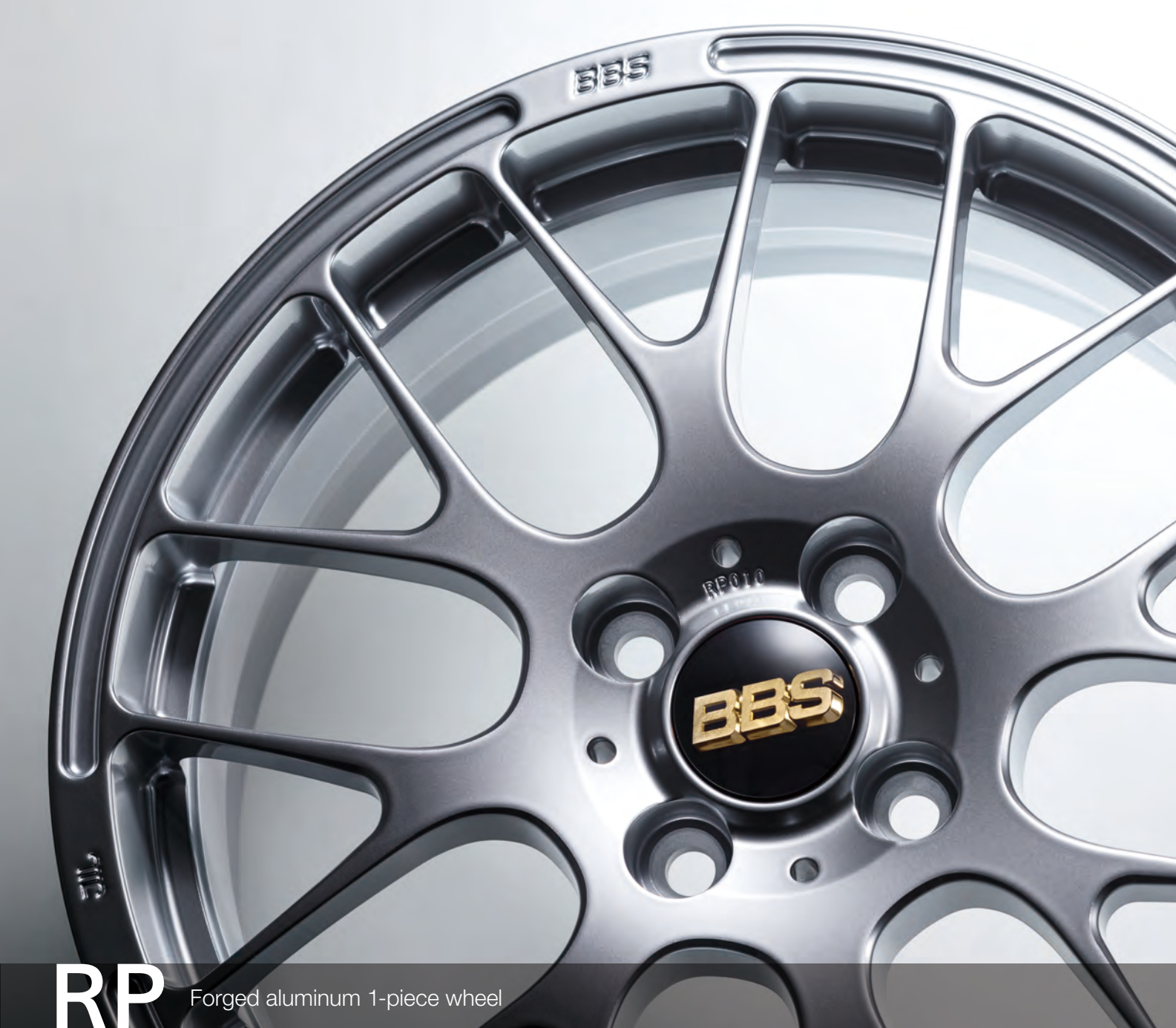
RP Forged aluminum 1-piece wheel

F1™ styling and lightweight construction—a superb wheel for compact sports cars