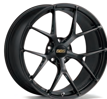
Matte Black (MB)