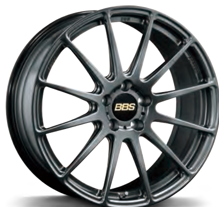
Diamond Black (DB)