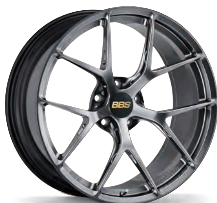
Diamond Black (DB)