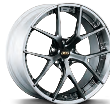
Diamond Black disk and Silver Diamond-cut rim (DB-SLD)