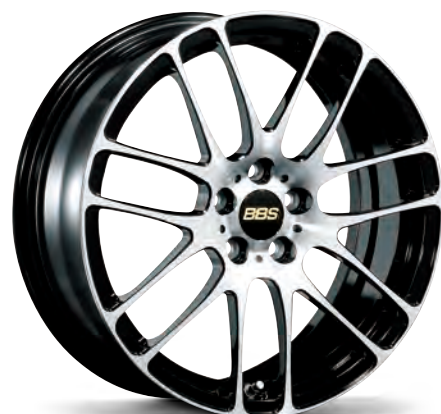
Black Diamond-cut (BKD)